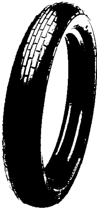
Super Twin RC TK 22